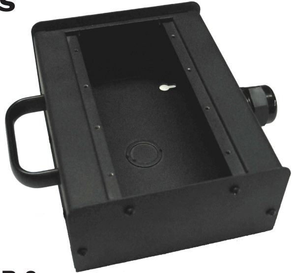
MB 2 (shown assembled with optional handle and strain relief)

Redco Mic boxes are available in several sizes to accommodate Redco's various UCP connector modules. This allows fast assembly of a custom mic box to suit customer requirements. MB Boxes have a black Powdercoat finish, and are pre-punched with wall mount holes and cutout for cable strain relief.